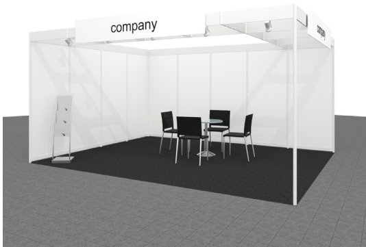
Your individual booth